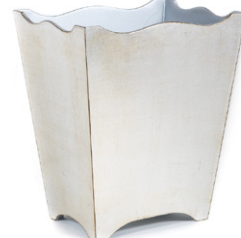
Florentine • Brushed Silver