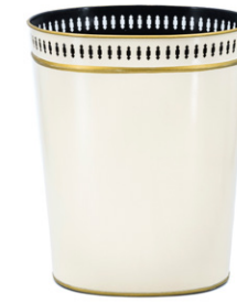
Lancaster • Cream/Gold