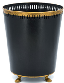
Noir • Black