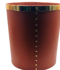
Leather • Brass Studded