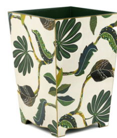
Decoupage • Green Leaves