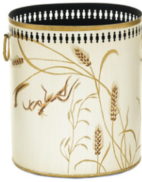
Dragonfly • Ivory