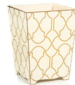
Decoupage • Lattice