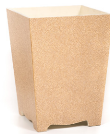
Galuchat • Sand