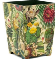
Decoupage • Cactus