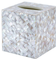
Mother of Pearl • Herringbone