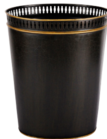
Lancaster • Black/Gold