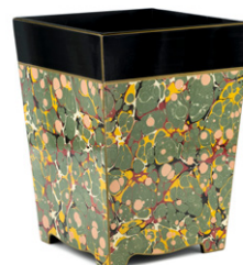
Decoupage • Marble