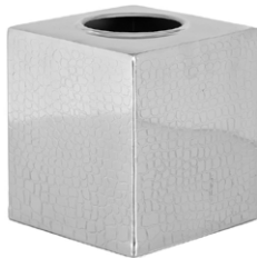
Steel • Etching