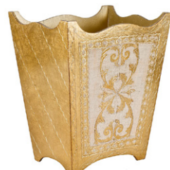
Royal Florentine • Gold/Ivory