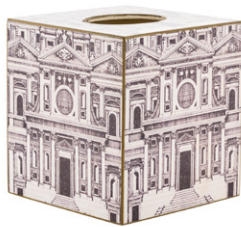
Fornasetti • Gold Leaf Trim