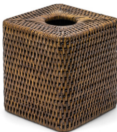
Rattan • Chestnut