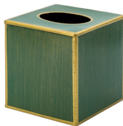
Lancaster • Green