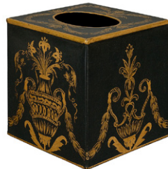
Festoon • Black