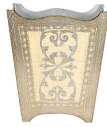
Royal Florentine • Silver/Ivory