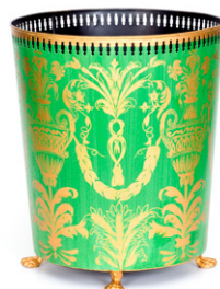
Festoon • Forest Green