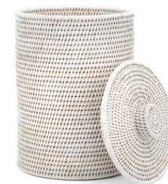
Rattan+Lid • Milk + Chestnut Liner included