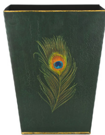
Peacock • Hunter Green