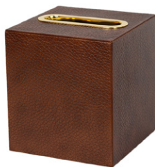
Leather • Tan