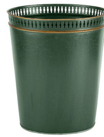
Lancaster • Green/Gold