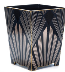
Decoupage • Gatsby Vintage