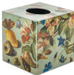
Wood • Butterfly