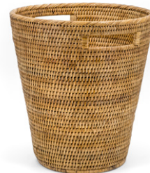
Rattan • Round Tapered Honey