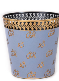
Eastern Swirl • Topaz Blue