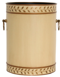
Grecian Leaves • Ivory