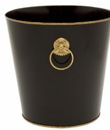
Milano • Dark