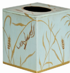
Dragonfly • Blue