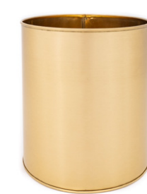
Brass • Cylinder