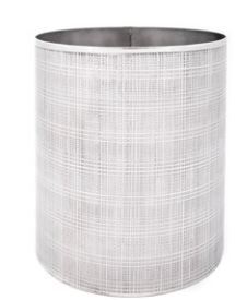
Steel • Etched