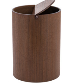
Wood • Round with liner