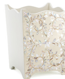
Mother of Pearl • Vines