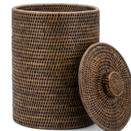
Rattan • Watervine