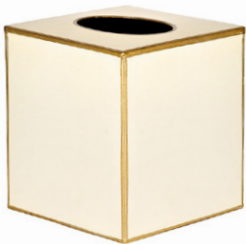
Plain Ivory • Gold Border