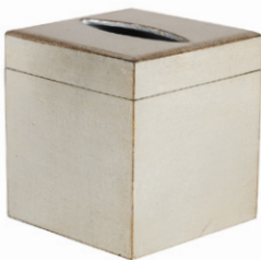
Royal Florentine • Silver