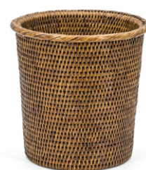
Rattan • Small w/Lip Chestnut