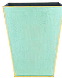
Plain Tapered • Blue