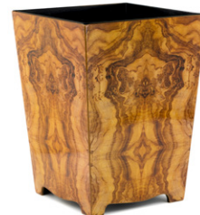
Decoupage • Burr Walnut