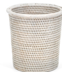
Rattan • Small w/Lip Milk