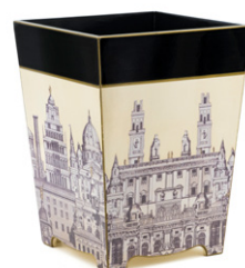
Decoupage • Neo Classical